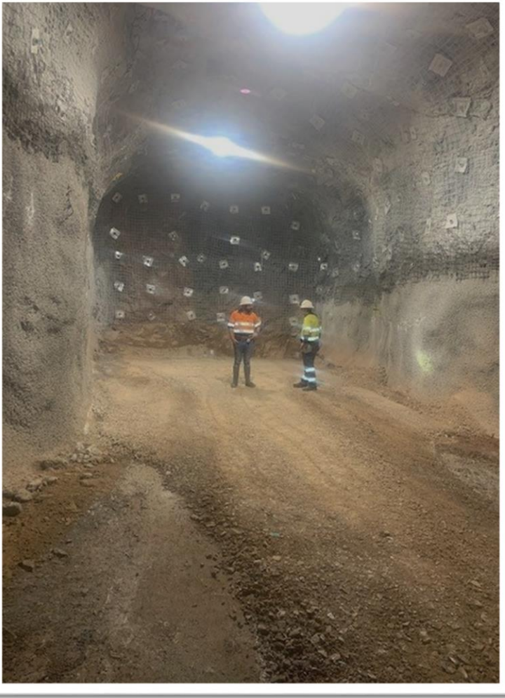
FIGURE 1: GOLDEN SWAN DRILL DRIVE